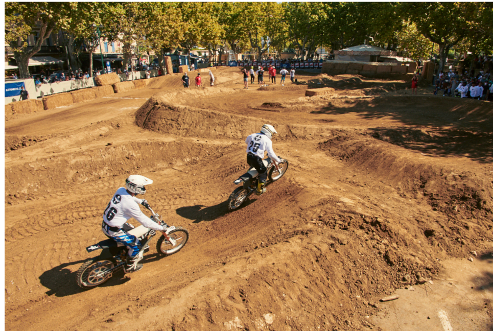
1700 tons of dirt in an empty lot in the center of Saint Tropez – instant motocross! [Fabio Afuso]

More than 1,700 tons of local soil was moved to create the track. Prat enlisted the help of a local architect to ensure it was the best possible track for the riders.