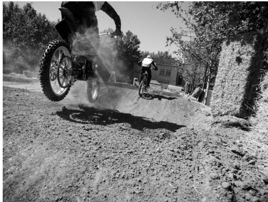
A gopher's eye view of the action! The riders could really throw the 63kg bikes around.