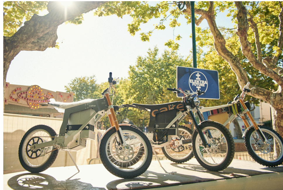
The CAKE Kalk racers and roadsters in various liveries: a winner of design awards all over Europe for its clean, Dieter Rams styling.

The competition brought together more than 100 riders with widely varying levels of experience and backgrounds. Motocross world champions such as Mickael Maschio shared the track with pilots who only participated in the sport recreationally. All riders operated the CAKE Kalk, a 67kg electric machine that delivered the power and torque comparable to a 200cc thermic motocross bike.