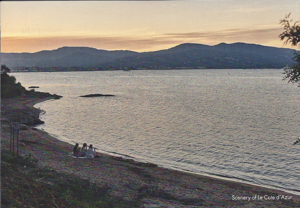
Scenery of Le Cote d'Azur